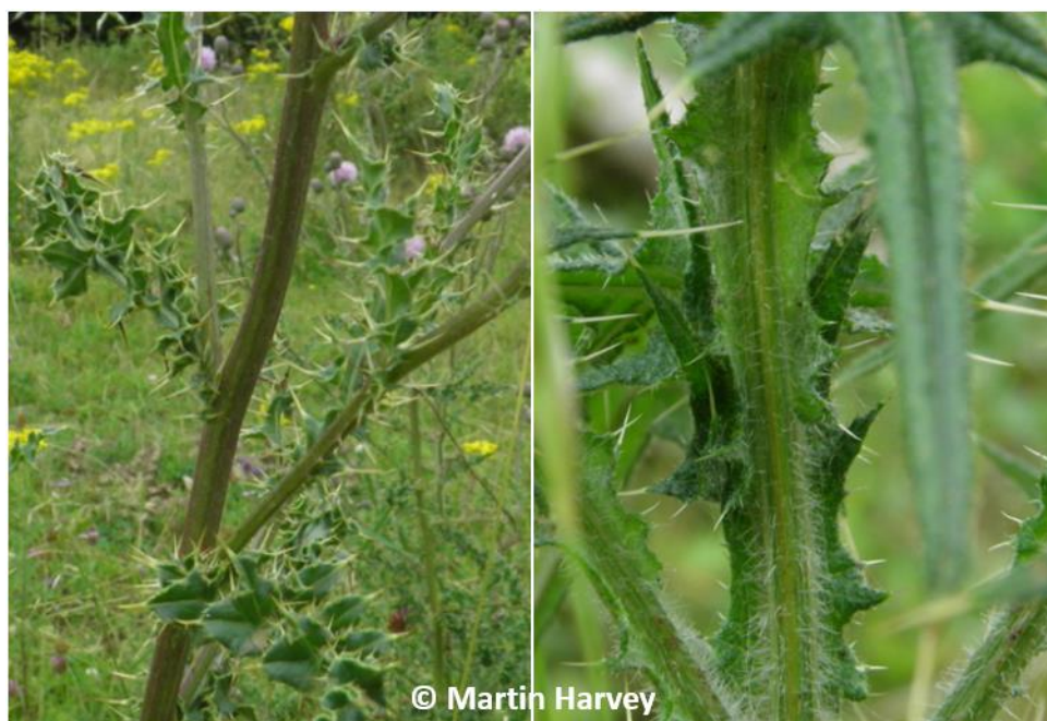
Creeping Thistle has no spines on its stems (left), Spear Thistle has spiny stems (right).

Spear Thistle , Cirsium vulgare , is found in a wide range of habitats, including overgrazed pastures and rough grassland, sea-cliffs, dunes, drift lines and disturbed habitats including arable fields, spoil heaps, waste ground and burnt areas in woodland. The flowers are larger and darker purple than for Creeping Thistle, and in Spear Thistle there are spines on both the leaves and the stems.