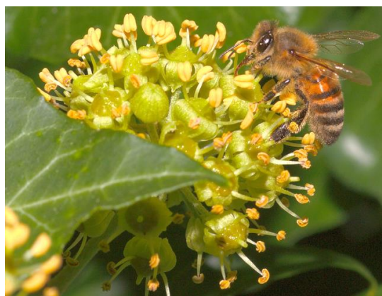
Honeybee on Ivy flower

Flower counts should be based on the number of flower heads (indicated by white ovals shown on the left in the above photo collage). The flower heads vary in size and in how separated they are, and it can be difficult to decide whether you are seeing one large flower head or a group of smaller ones, so just estimate a consistent number as best you can.