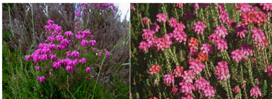
The larger, brighter flowers of Bell Heather (left, © nz_willowherb via Flickr CC) and Cross-leaved Heath (right, © Natural England via Flickr CC).

Flower counts should be based on the number of flower spikes (indicated by ovals at top-left in the above photo collage). If the flowers in your patch are very dense so it is fine to make an estimate, e.g. by counting flowers in a quarter of the quadrat and multiplying by four to get a total for the whole quadrat.